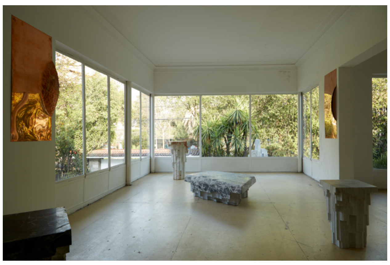
The Last Tenant curated by Mario Garcia Torres install shot